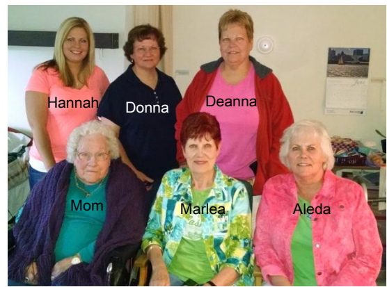
visiting with Mom in Monroe